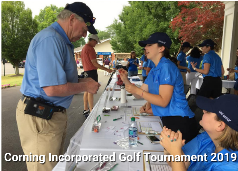
Corning Incorporated Golf Tournament 2019