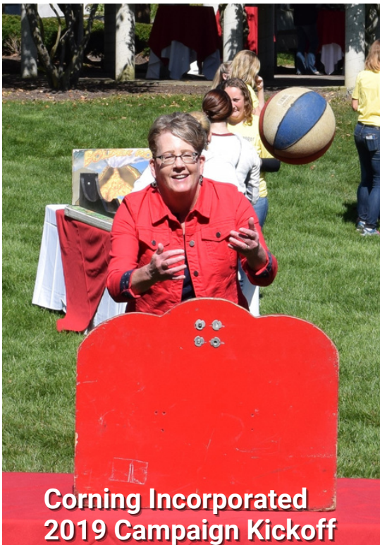
Corning Incorporated 2019 Campaign Kickoff