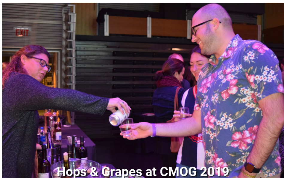
Hops & Grapes at CMOG 2019