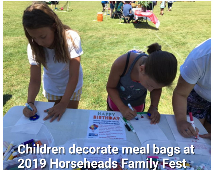
Children decorate meal bags at 2019 Horseheads Family Fest