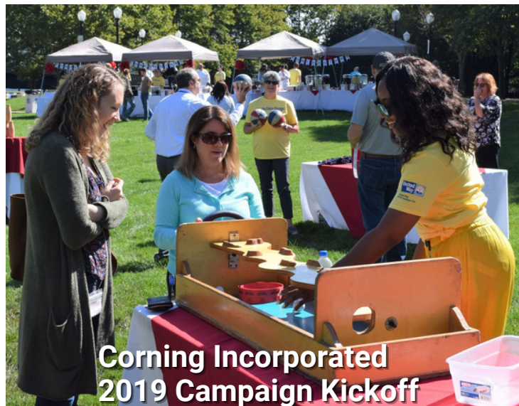
Corning Incorporated 2019 Campaign Kickoff