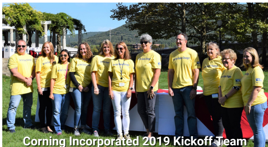
Corning Incorporated 2019 Kickoff Team