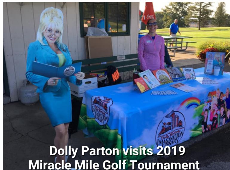
Dolly Parton visits 2019 Miracle Mile Golf Tournament