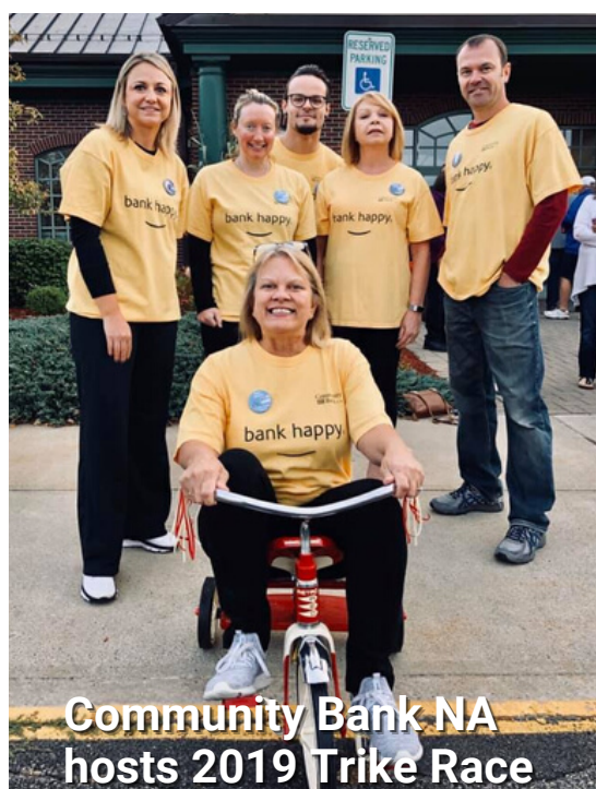
Community Bank NA hosts 2019 Trike Race