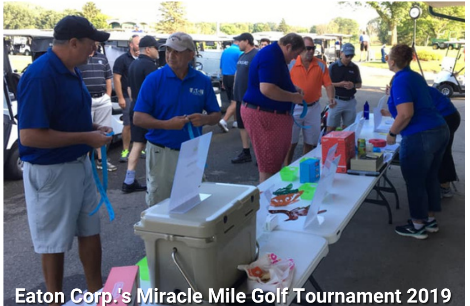
Eaton Corp.'s Miracle Mile Golf Tournament 2019