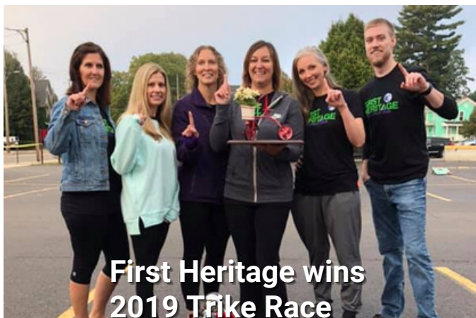
First Heritage wins 2019 Trike Race